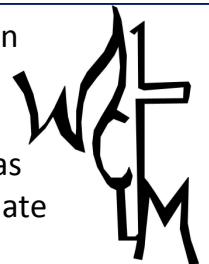
WESLEYAN CAMPUS MINISTRY TEXAS A&M COMMERCE

The Mission of the Month for September is the Wesleyan Campus Ministry. Its mission is to help Texas A&M University-Commerce students grow deeper in Christ, reach farther to serve the world, and connect together as sisters and brothers. All $1 bills placed in the offering plate and designated gifts during September will support this ministry of the United Methodist Church.