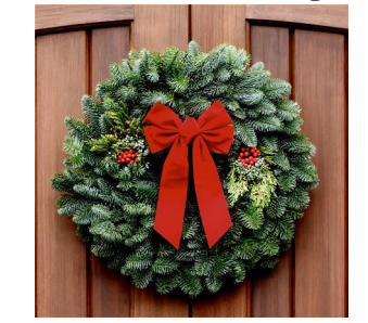
Orders for fresh evergreens are due Monday, November 6. Look for order forms in the Gathering Area or in the church office to share with friends and coworkers, or order online from the church's homepage.