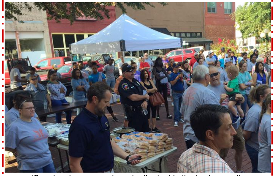
(Our church presence is under the tent in the background)

We had several volunteers who worked at the FUMC-C table and connected with the community while handing out bottles of cold water that were donated by Fix & Feed.