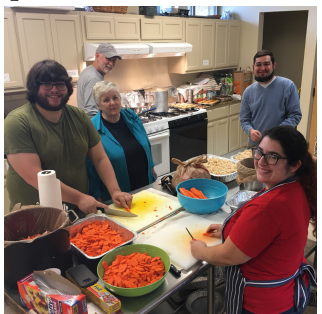
Nothing brings people together like good stew!

Together, we can make it merry! We need your help to craft, bake, donate, promote, set up, price, sell, and clean up. Please contact Angela Roberts at 972.765.6547 to get involved.