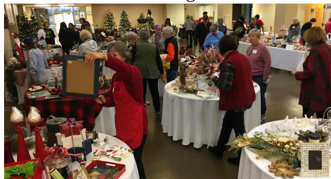
2016 Merry Marketplace