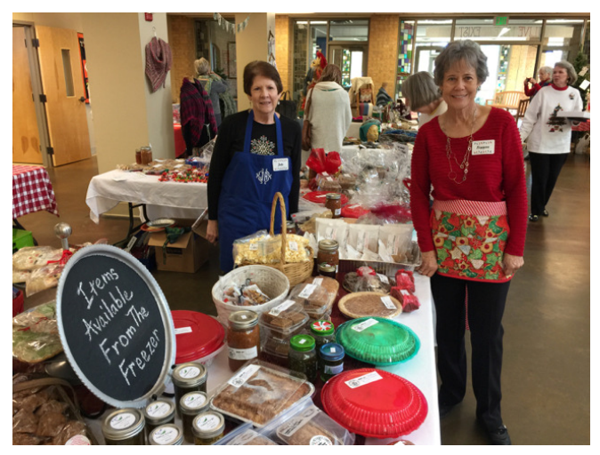
All kinds of delectable treats