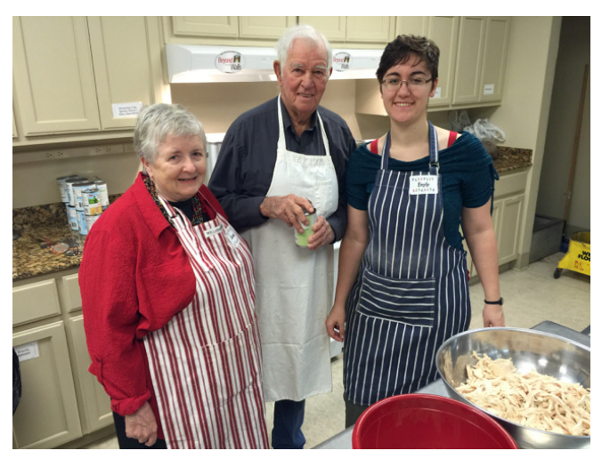
Cooks making chicken and beef stews from scratch