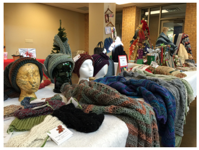
Prayer Shawl hats, scarves and more