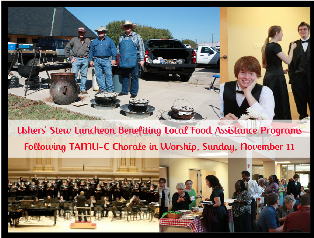
Ushers' Stew Luncheon Benefiting Local Food Assistance Programs Following TAMU-C Chorale in Worship, Sunday, November 11