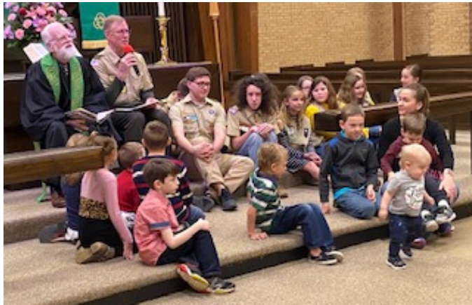
Children's Place at the Altar on Scout Sunday, February 9

We hope you can join us at 9:45-10:40 each Sunday!