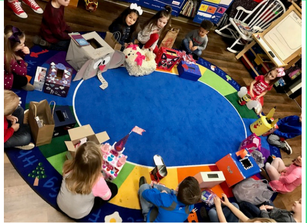
Little Ark Pre-K Class Valentine's Day Party

* The Little Ark Center will be closed on Friday, March 13 for Spring Break.