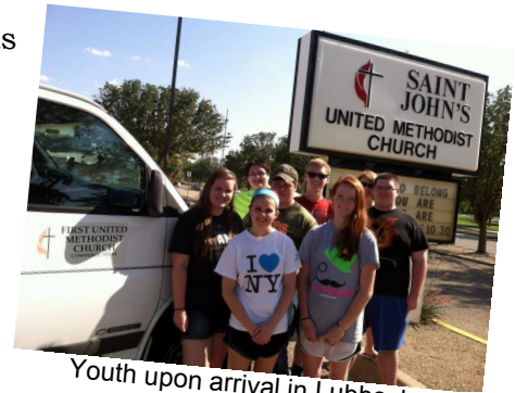
Youth upon arrival in Lubbock for U.M. ARMY