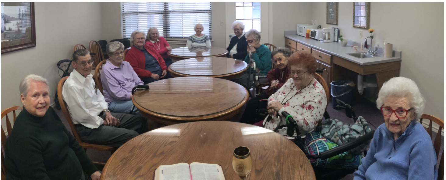
The participants in our monthly communion service at Country Home Estates