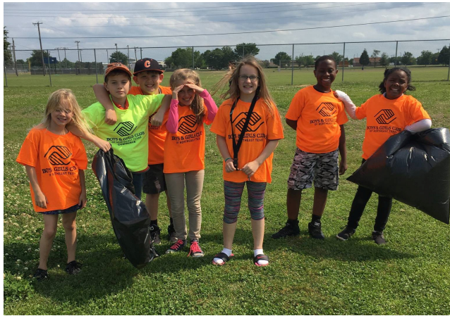
Commerce Club members help clean up the AC Williams playground