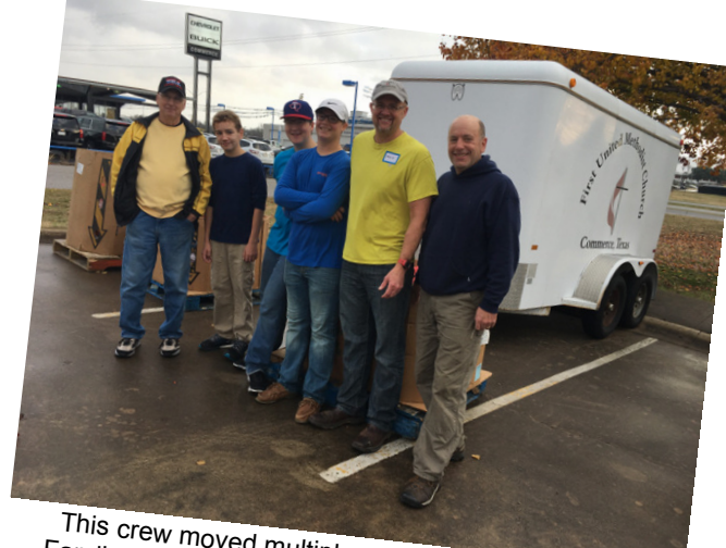
This crew moved multiple pallets of food from the Family Ministry Center up the hill to Methodist Drive so we could easily load cars.