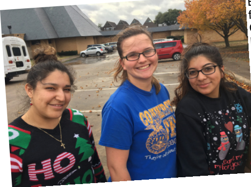
Employees from Smile Corner Dentistry provided smiles and helping hands.