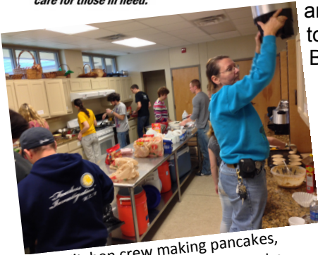
Kitchen crew making pancakes, sausage and eggs for 300 at the Thanksgiving distribution