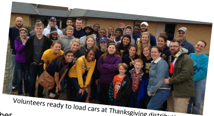
Volunteers ready to load cars at Thanksgiving distribution

and the community came together to distribute the baskets and host the Last Saturday Breakfast in the Family Ministry Center.