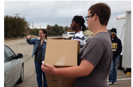
Each family received a box of dry goods and produce, a dozen eggs, and a frozen turkey