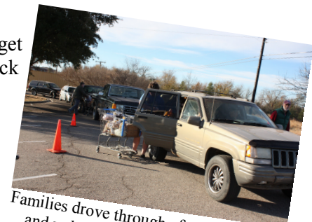
Families drove through after checking in and volunteers helped load them up