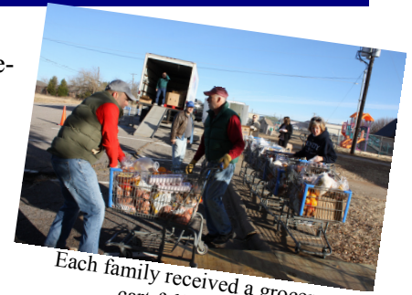
Each family received a grocery cart full of food

I thank God every day that this church family strives to be faithful by being a blessing to all.