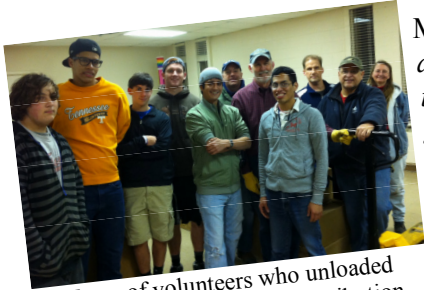
Team of volunteers who unloaded non-perishables prior to distribution

Following are the scripture verses and Jim's testimony.