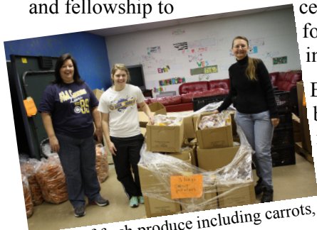
Plenty of fresh produce including carrots, potatoes, oranges, and pears