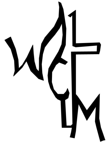
WESLEYAN CAMPUS MINISTRY TEXAS A&M COMMERCE

A VERY MERRY CHRISTMAS and Happy New Year!