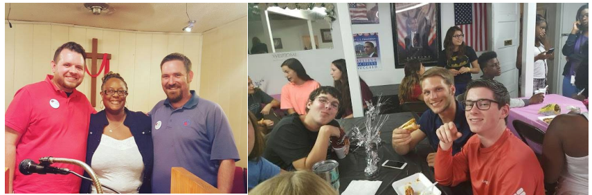
Fellowship after joint worship service at Griffith Chapel where a work team installed a new bathroom

On behalf of the United Methodist Action Reach-Out Mission by Youth (U.M. ARMY) group that came to Commerce the week of June 26-July 2, we thank you for your generous hospitality and welcome. Your church and community welcomed high school youth and adult volunteers from Cypress, Grand Prairie, Huntsville, Lubbock and El Paso/Juarez with open arms, love and compassion. For that, we are thankful.