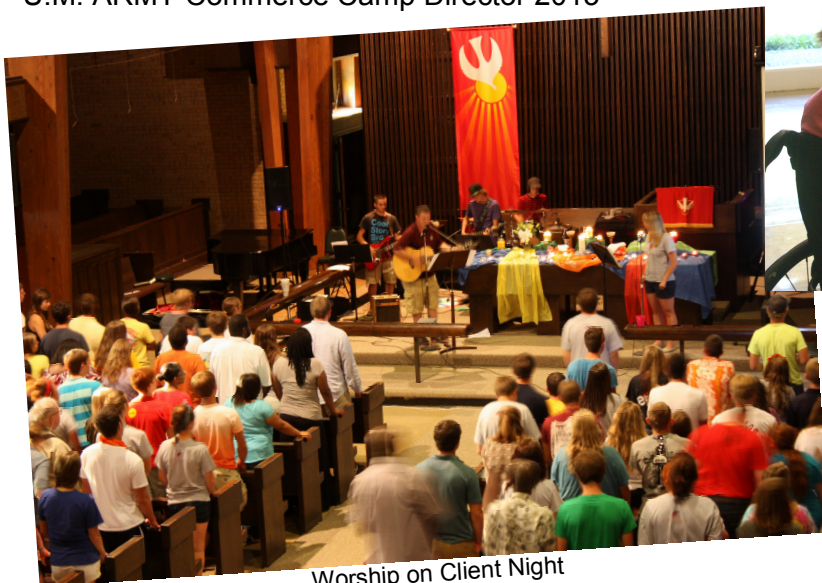
Worship on Client Night