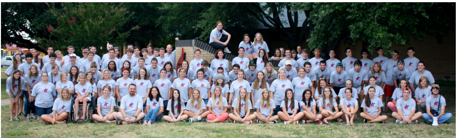
U.M. ARMY Camp Commerce 2013—Authentic Witness