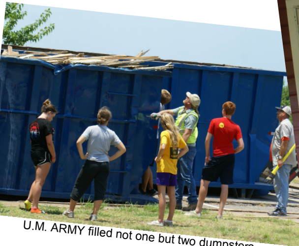
U.M. ARMY filled not one but two dumpsters