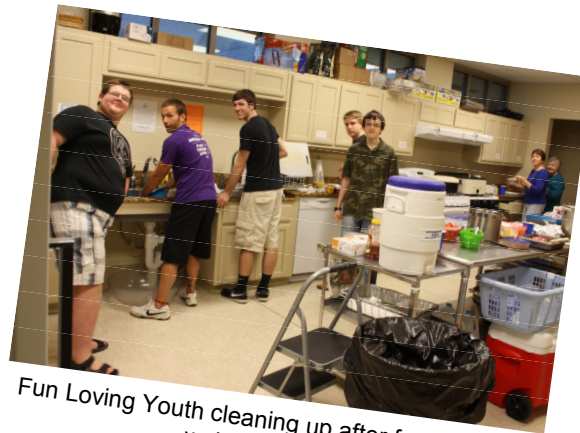
Fun Loving Youth cleaning up after for Sunday's welcome dinner